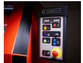
Intuitive control panel