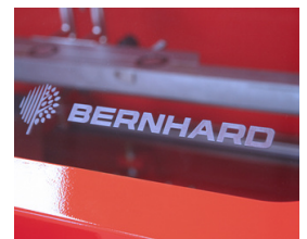
Scratch resistant panels

The Express Dual 4100 is the world's most popular reel grinder.