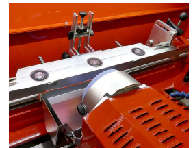
Mounting bar with tri-magnet assist