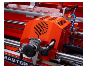
Variable traverse system

The Anglemaster 4100 is the world's most popular bedknife grinder, upgraded. Features more flexibility and control over grinding practices and evolving with ever changing bedknife materials